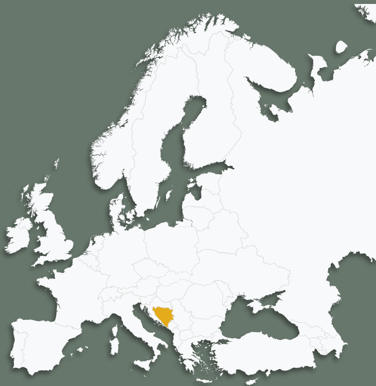
Location of Bosnia and Herzegovina (BiH) in Europe