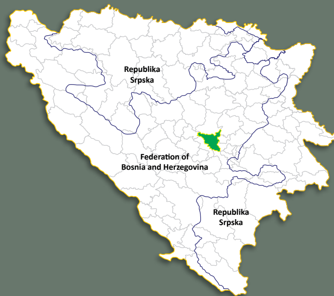
Location of Visoko Municipality in BiH